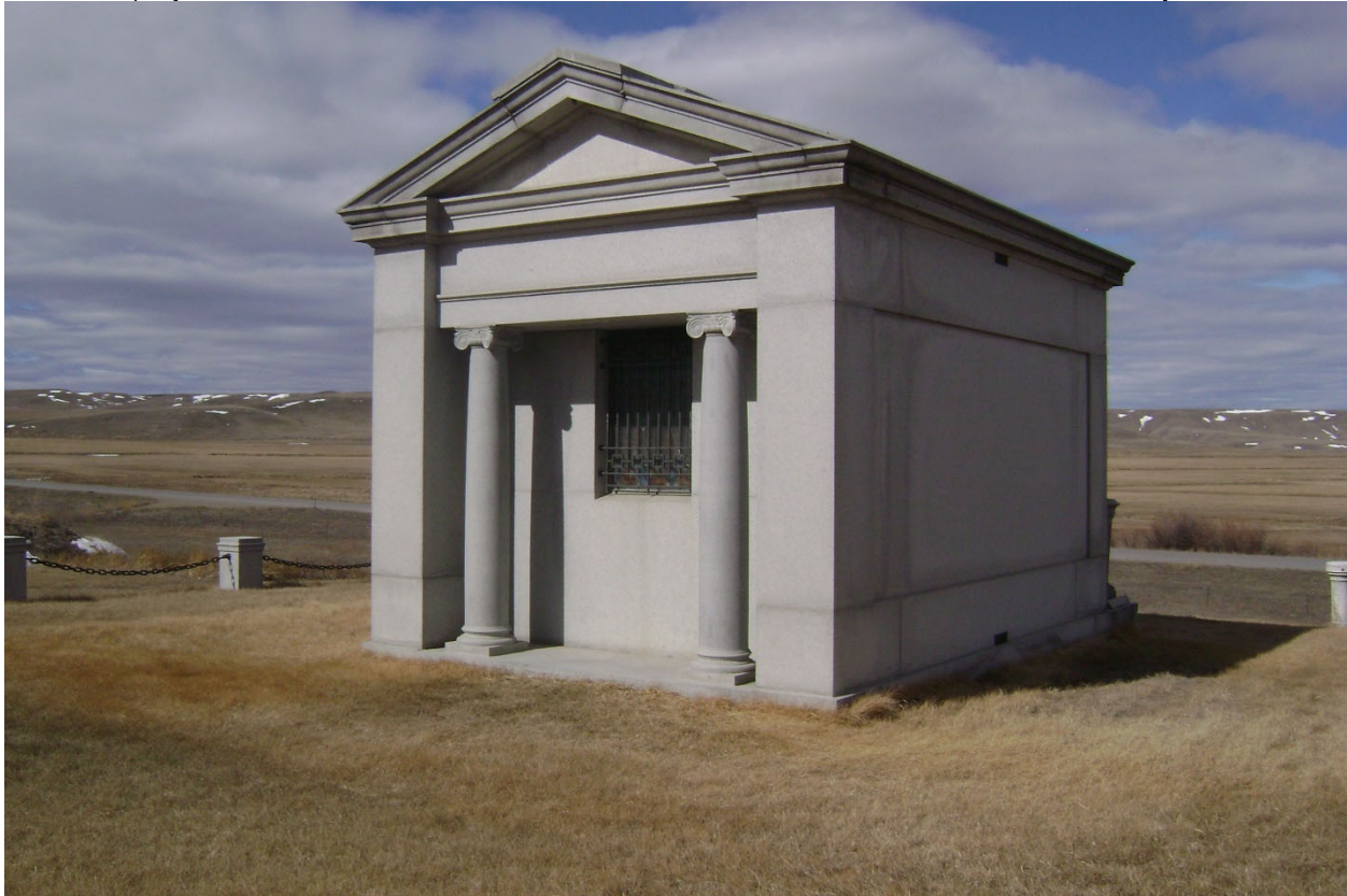
MT_PowellCounty_HillcrestCemetery_#0019, south (rear) and east facades looking northwest. Date of Photograph: 3/14/22.