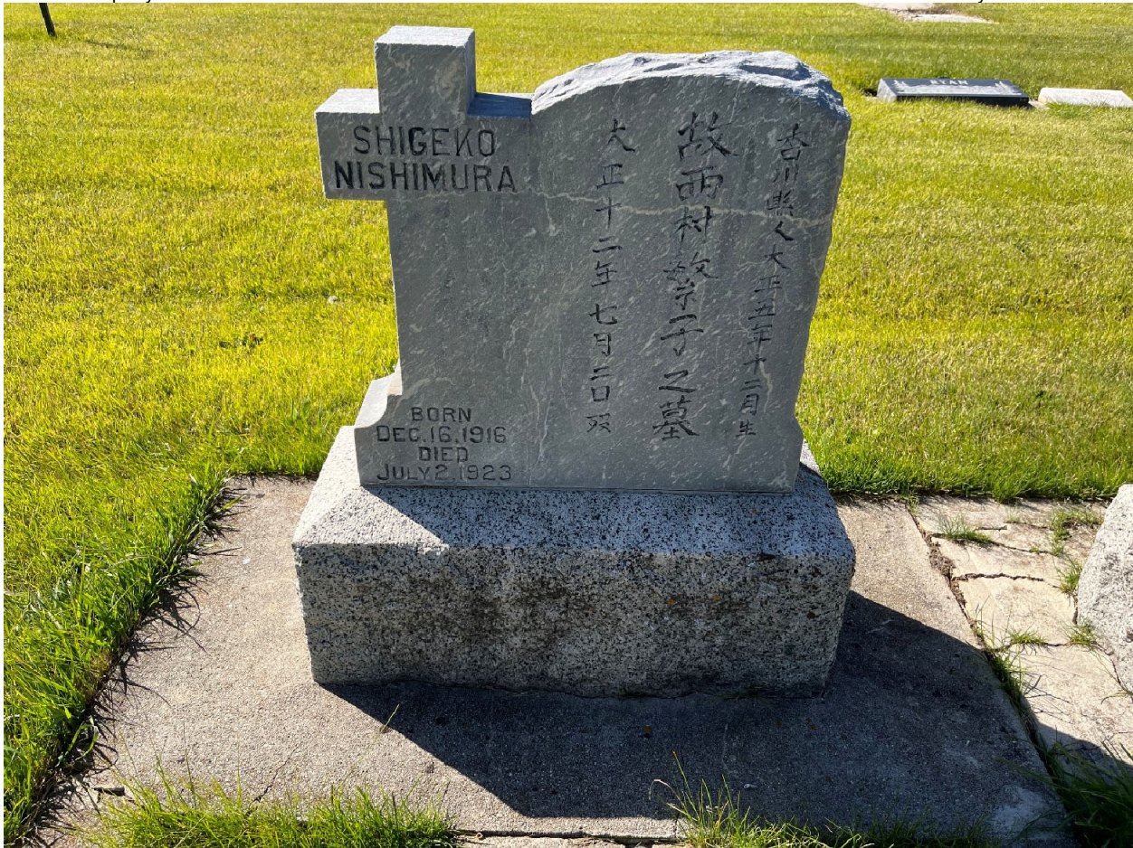
MT_PowellCounty_HillcrestCemetery_#0011, tombstone of Shigeko Nashimura, Japanese Row, looking west. Date of Photograph: 8/31/22