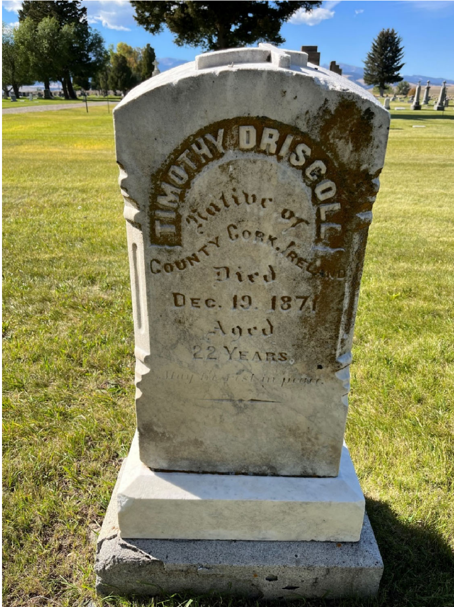
MT_PowellCounty_HillcrestCemetery_#0032, one of the oldest marked graves of imported marble, the date is incorrect and should be 1870, view west. Date of Photograph: 9/27/22