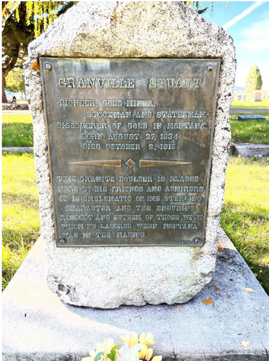
MT_PowellCounty_HillcrestCemetery_#0015, Granville Stuart Monument, Resource #5, looking west.