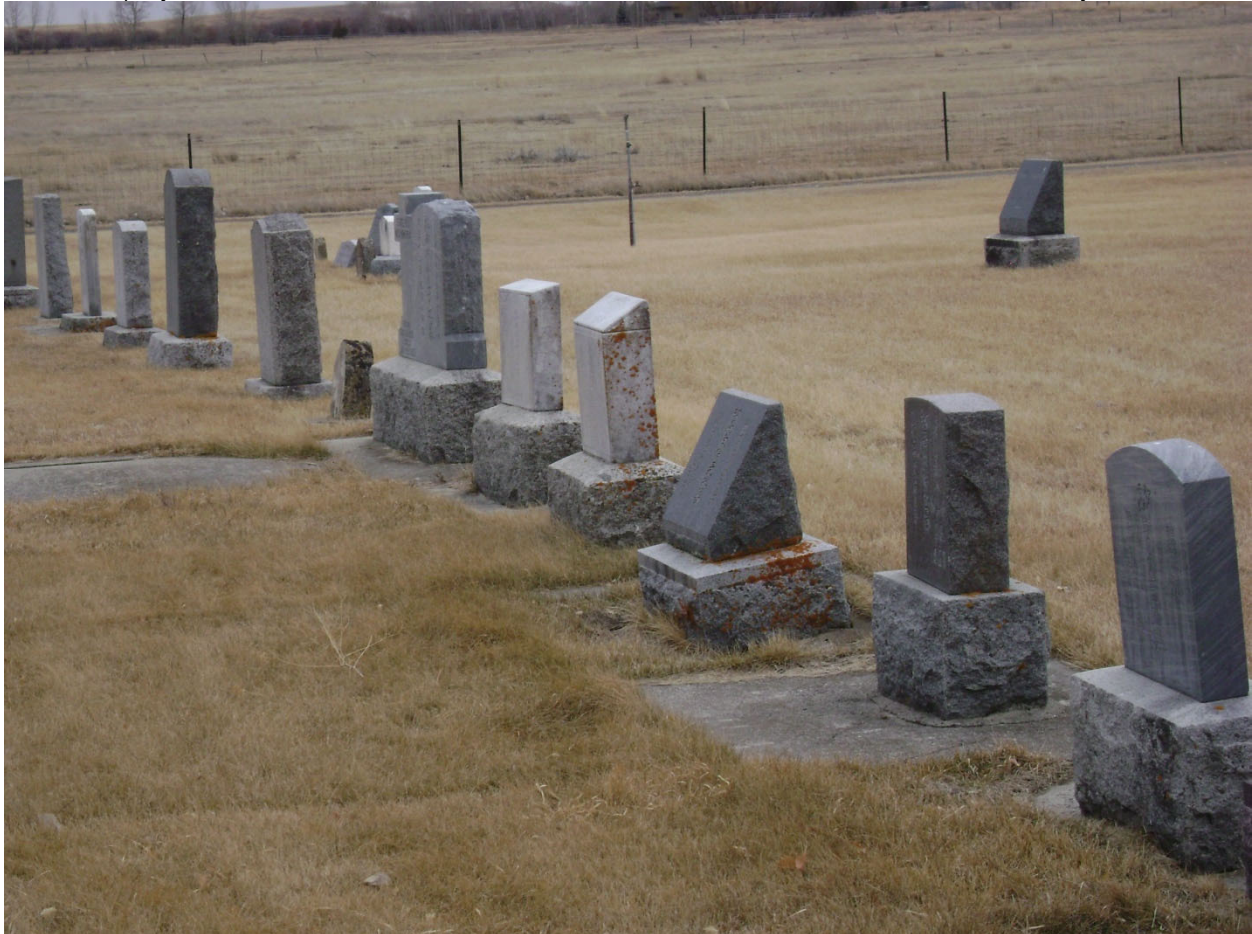
MT_PowellCounty_HillcrestCemetery_#0010, Japanese Row, Resource #3, looking southwest. Date of Photograph: 1/25/20