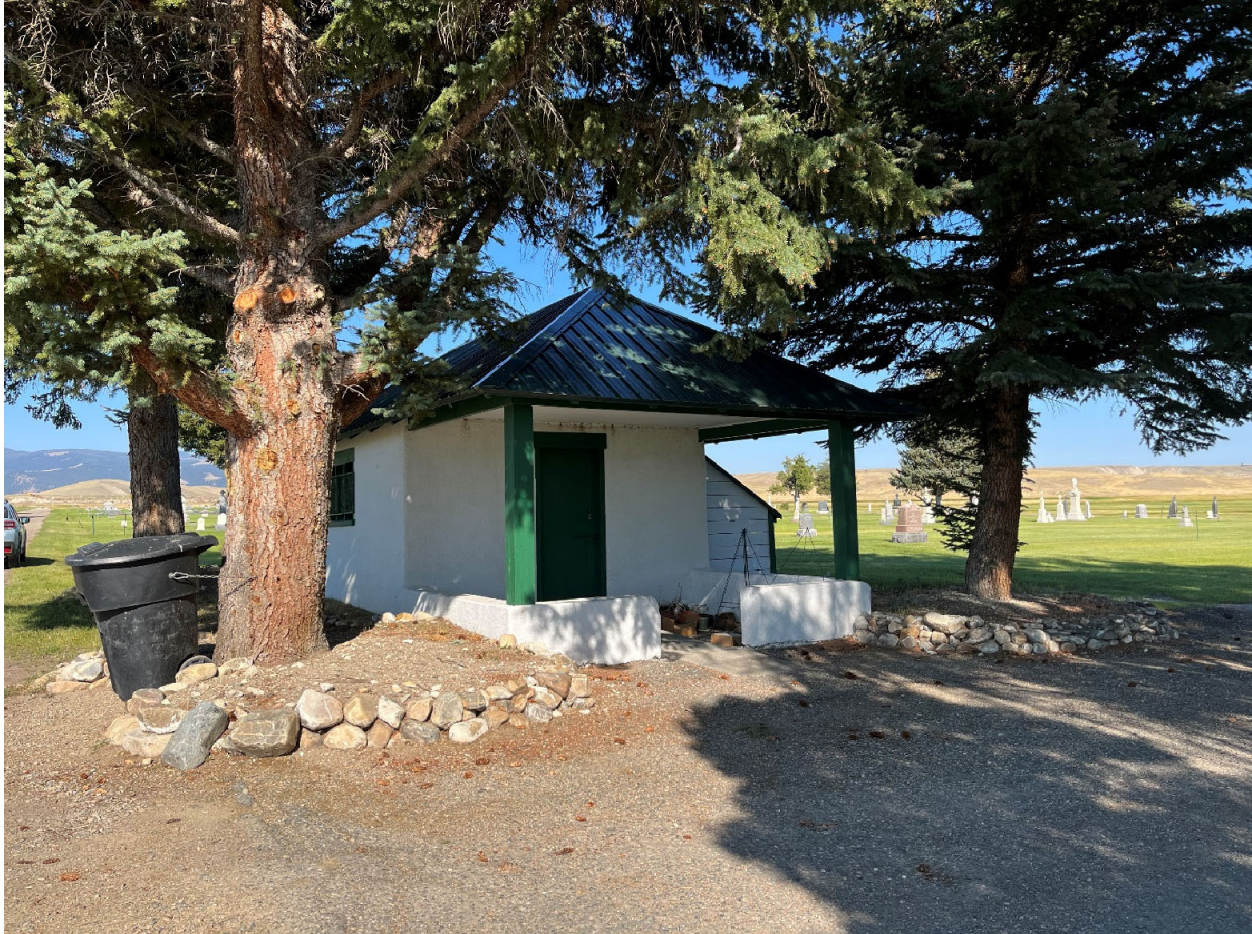
MT_PowellCounty_HillcrestCemetery_#0022, Tool House, Resource #9, looking west. Date of Photograph: 8/31/22.