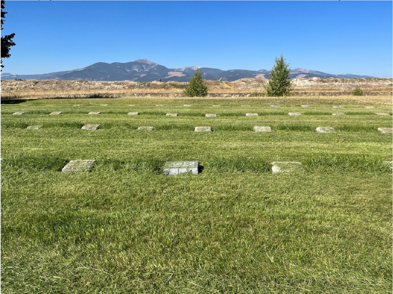
MT_PowellCounty_HillcrestCemetery_#0005, Prison cemetery overview, looking west.