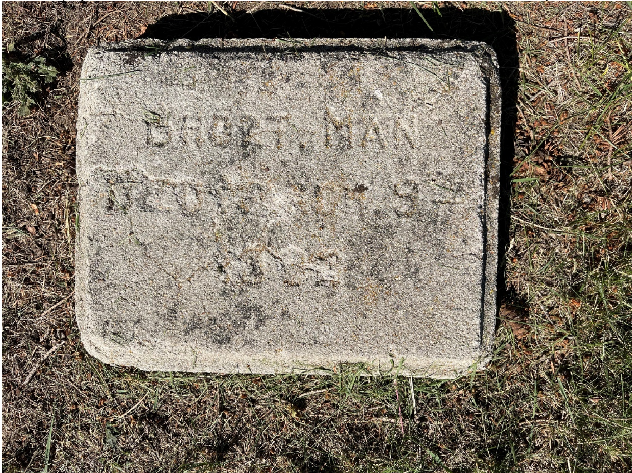
MT_PowellCounty_HillcrestCemetery_#0004, Prison Cemetery, grave marker of Short Man, died 1892.