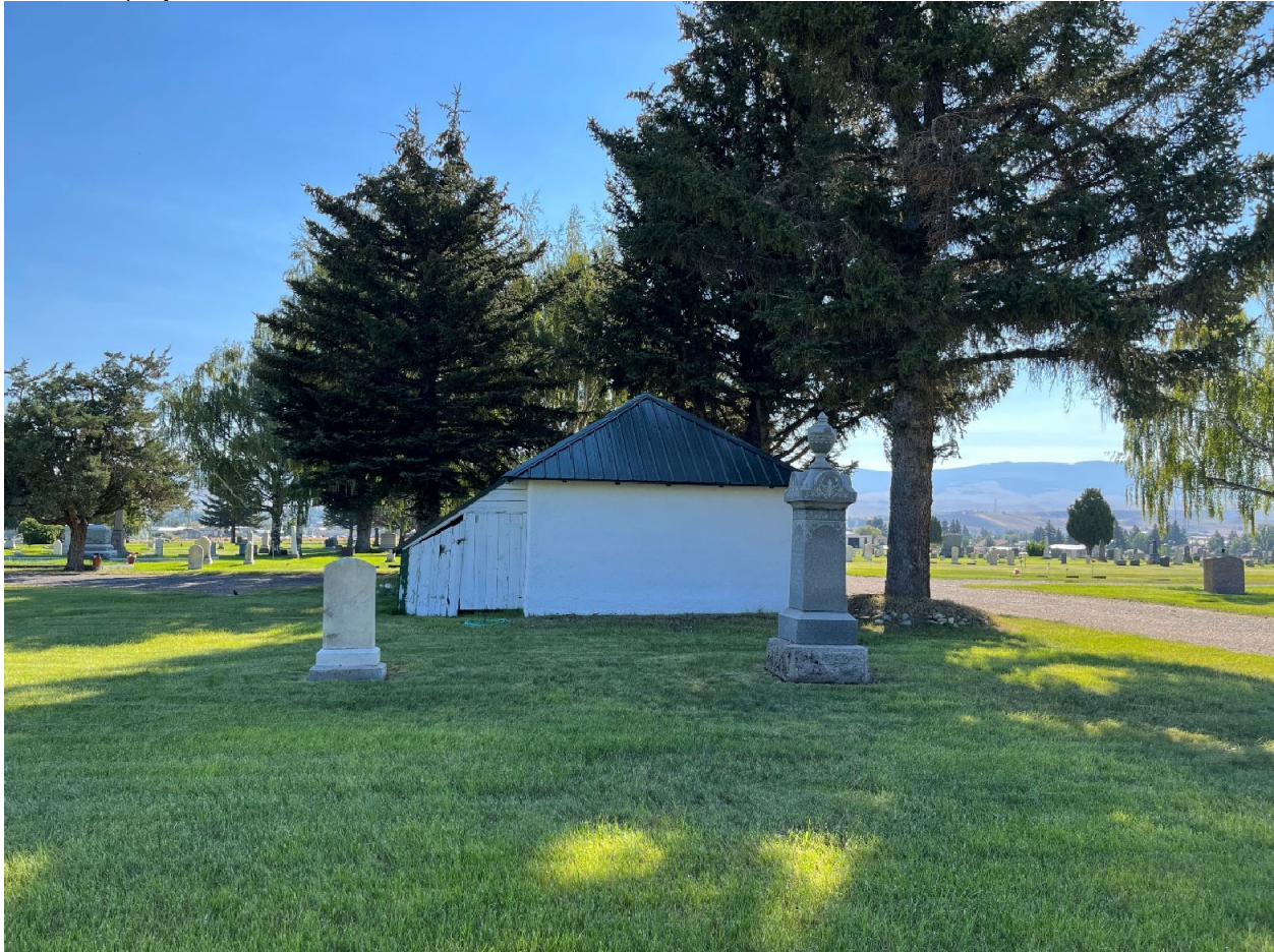
MT_PowellCounty_HillcrestCemetery_#0025, Tool House, west façade, looking east. Date of Photograph: 8/31/22