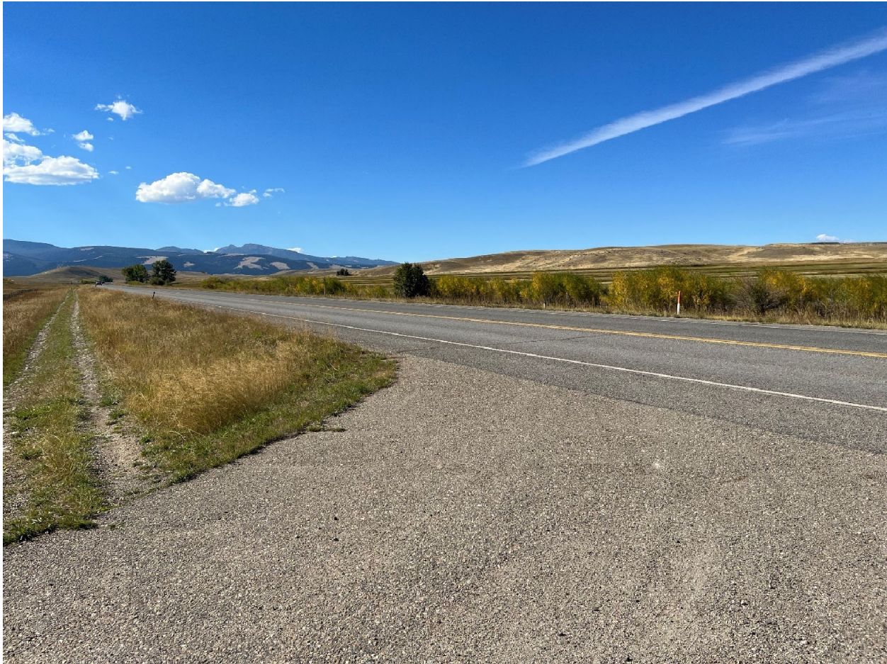
MT_PowellCounty_HillcrestCemetery_#0033, view to the northwest from main entry. Date of Photograph: 9/27/22