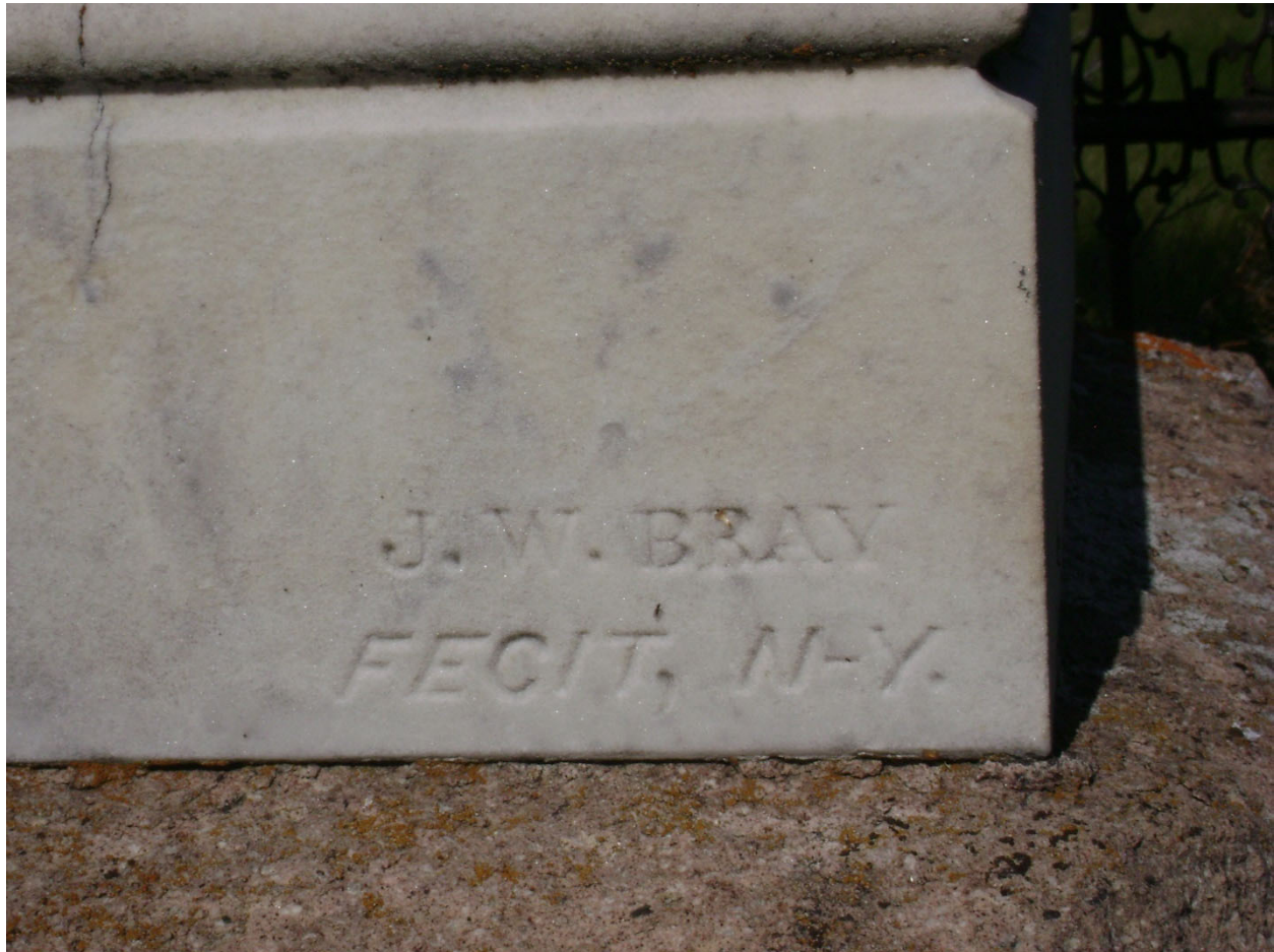
MT_PowellCounty_HillcrestCemetery_#0008, signature on Clark children's grave. Date of Photograph: 10/6/19