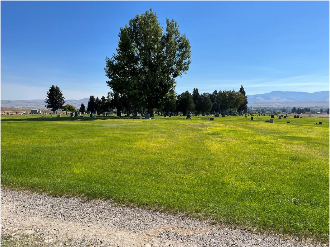
MT_PowellCounty_HillcrestCemetery_#0002, Hillcrest Cemetery overview looking east. Date of Photograph: 9/27/22