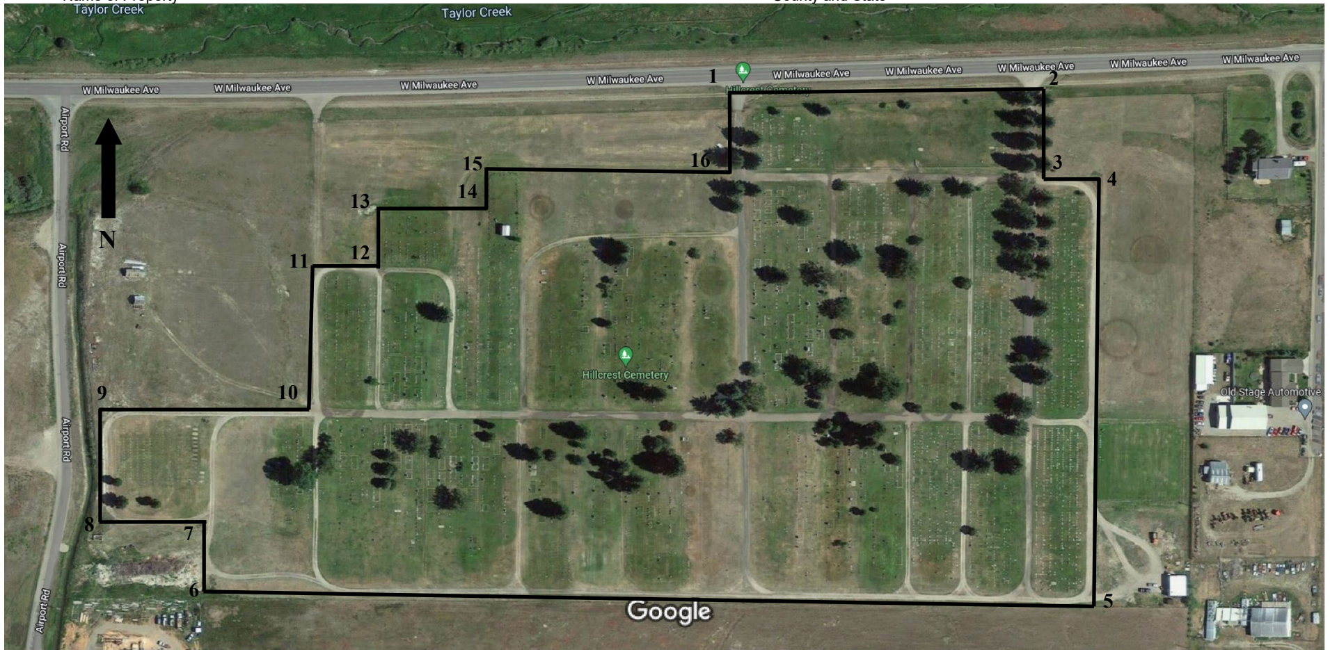
Imagery ©2022 CNES / Airbus, Maxar Technologies, USDA/FPAC/GEO, Map data ©2022 100 ft

Aerial View of Hillcrest Cemetery, N1/2 N1/2 of Section 5 of Township 7 N Range 9W. 1) Latitude: 46.396900, Longitude: -112.755440, 2) Latitude: 46.396930, Longitude: -112.753130, 3) Latitude: 46.396480, Longitude: -112.753160, 4) Latitude: 46.396470, Longitude: -112.752760, 5) Latitude: 46.394340, Longitude: -112.752760 6) Latitude: 46.394380, Longitude: -112.759210, 7) Latitude: 46.394730, Longitude: -112.759230, 8) Latitude: 46.394770, Longitude: -112.759940, 9) Latitude: 46.395300, Longitude: -112.759930, 10) Latitude: 46.395320, Longitude: -112.758420, 11) Latitude: 46.396020, Longitude: -112.758400, 12) Latitude: 46.396040, Longitude: -112.757960, 13) Latitude: 46.396320, Longitude: -112.757970, 14) Latitude: 46.396330, Longitude: -112.757150, 15) Latitude: 46.396510, Longitude: -112.757170, 16) Latitude: 46.396480, Longitude: -112.755360.