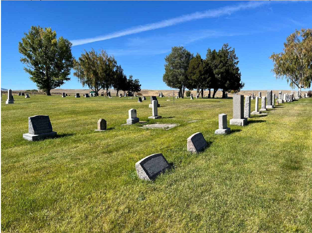
MT_PowellCounty_HillcrestCemetery_#0009, Japanese Row, Resource #3, looking northwest. Date of Photograph: 9/27/22