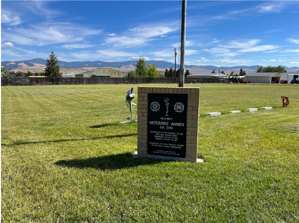
MT_PowellCounty_HillcrestCemetery_#0034, view to the southeast, Veterans Annex. Date of Photograph: 9/27/22