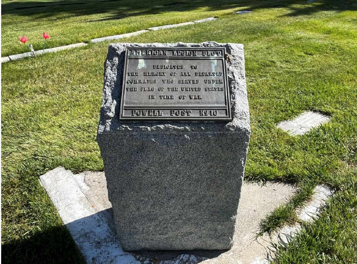
MT_PowellCounty_HillcrestCemetery_#0017, American Legion Memorial, Resource #7, looking southeast. Date of Photograph: 8/31/22