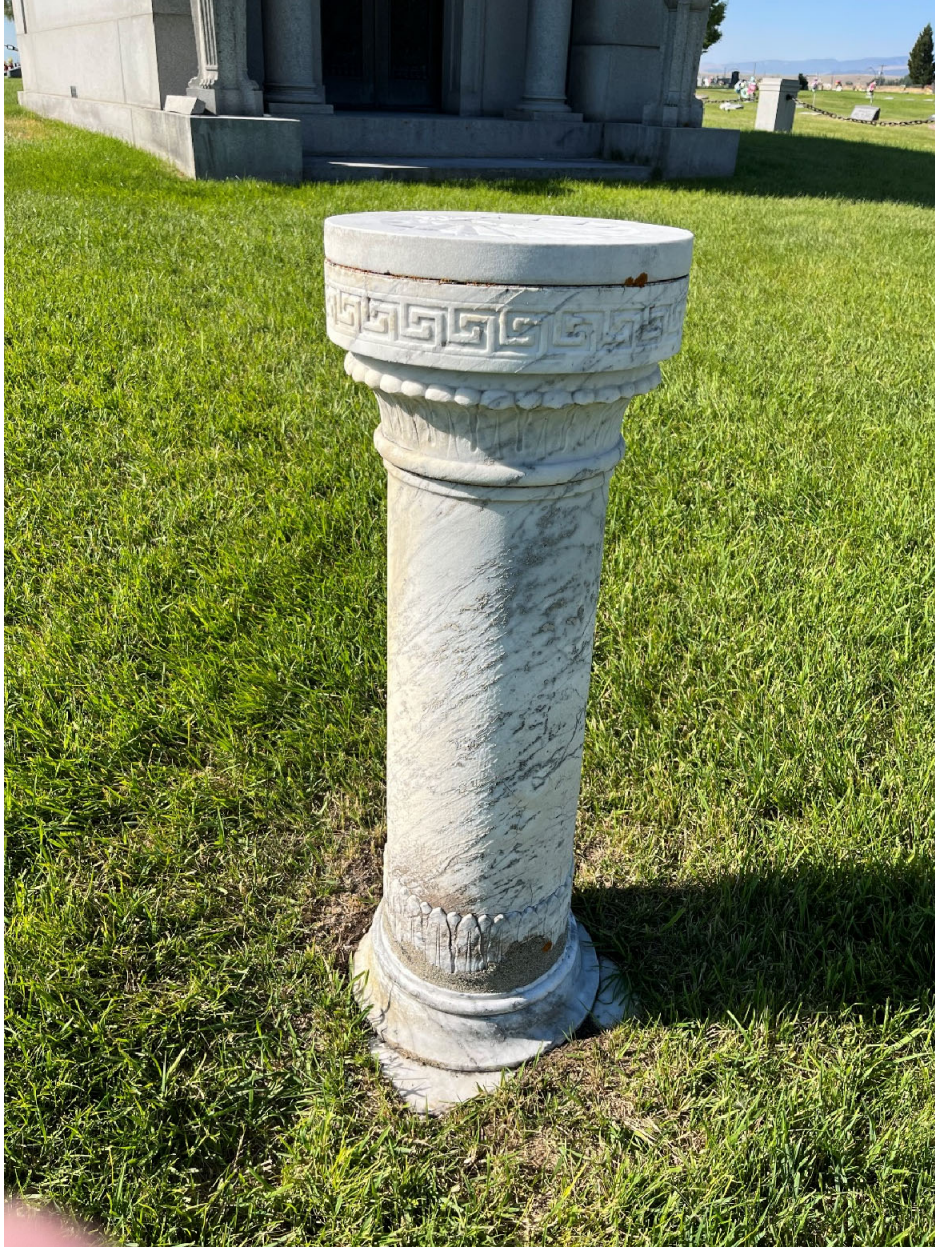
MT_PowellCounty_HillcrestCemetery_#0020, sun dial, Morony Mausoleum, looking southwest. Date of Photograph: 8/31//22.