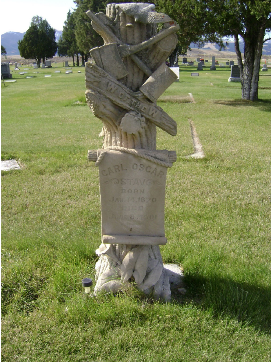
MT_PowellCounty_HillcrestCemetery_#0030, tombstone, looking west. Date of Photograph: 10/6/19