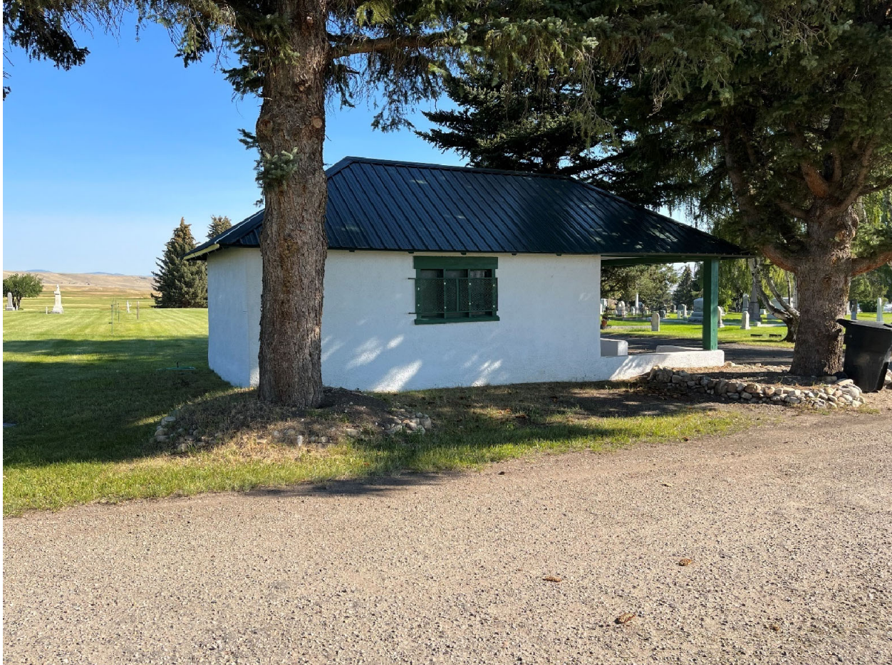
MT_PowellCounty_HillcrestCemetery_#0024, Tool House, south façade, looking north. Date of Photograph: 8/31/22