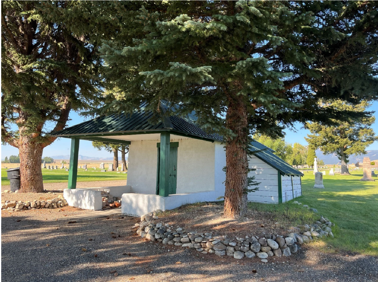
MT_PowellCounty_HillcrestCemetery_#0023, Tool House, west and east facades, looking southwest.