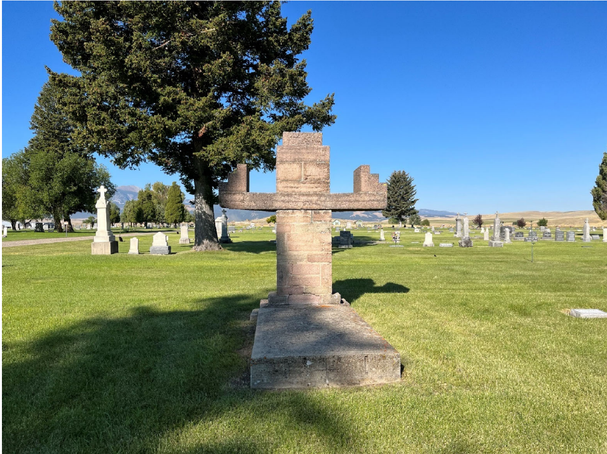
MT_PowellCounty_HillcrestCemetery_#0013, Catholic Memorial, Resource #4, looking west. Date of Photograph: 8/31/22