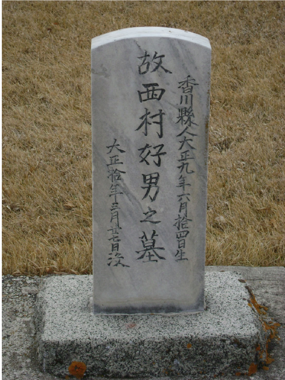
MT_PowellCounty_HillcrestCemetery_#0012, Tombstone in Japanese Row looking west. Date of Photograph: 1/25/20