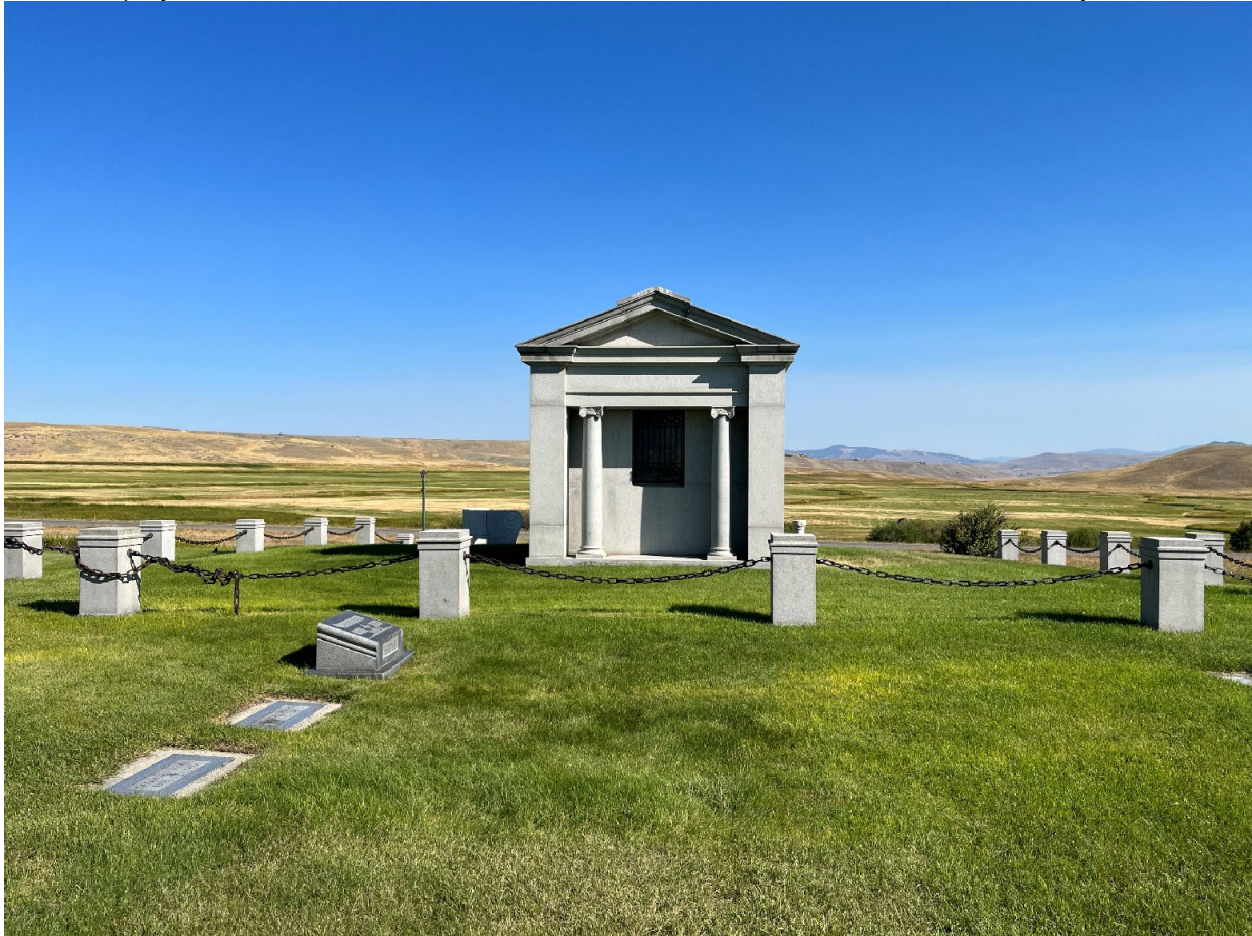
MT_PowellCounty_HillcrestCemetery_#0018, Morony Mausoleum, Resource #8, looking southwest.