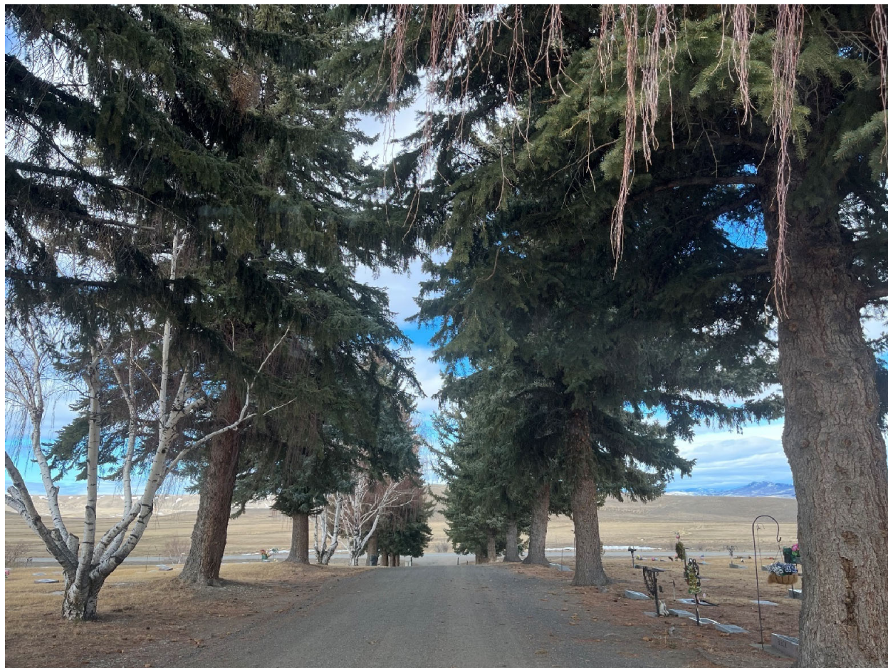
MT_PowellCounty_HillcrestCemetery_#0001, old growth trees at the main entry, looking north. Date of Photograph: 3/14/22