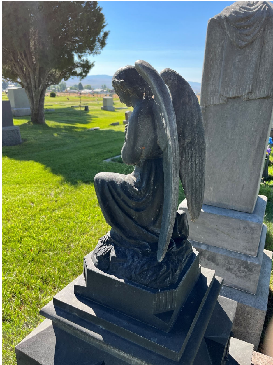
MT_PowellCounty_HillcrestCemetery_#0031, zinc tombstone of Anna Napton, view south. Date of Photograph: 8/31/22