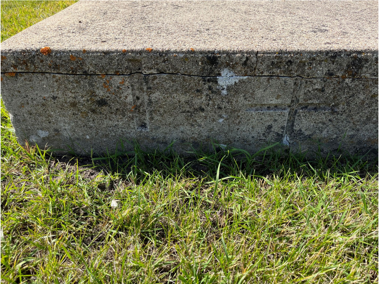
MT_PowellCounty_HillcrestCemetery_#0014, Catholic Memorial's concrete slab base, impressions of the gate hardware. Date of Photograph: 8/31/22