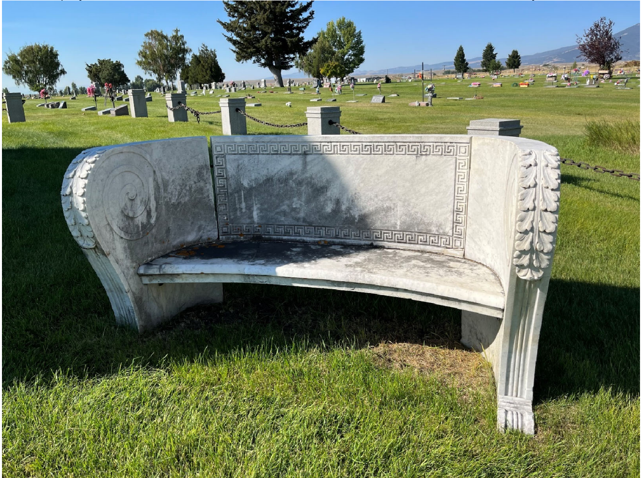
MT_PowellCounty_HillcrestCemetery_#0021, Greek Revival style bench, Morony Mausoleum, looking southwest. Date of Photograph: 8/31/22