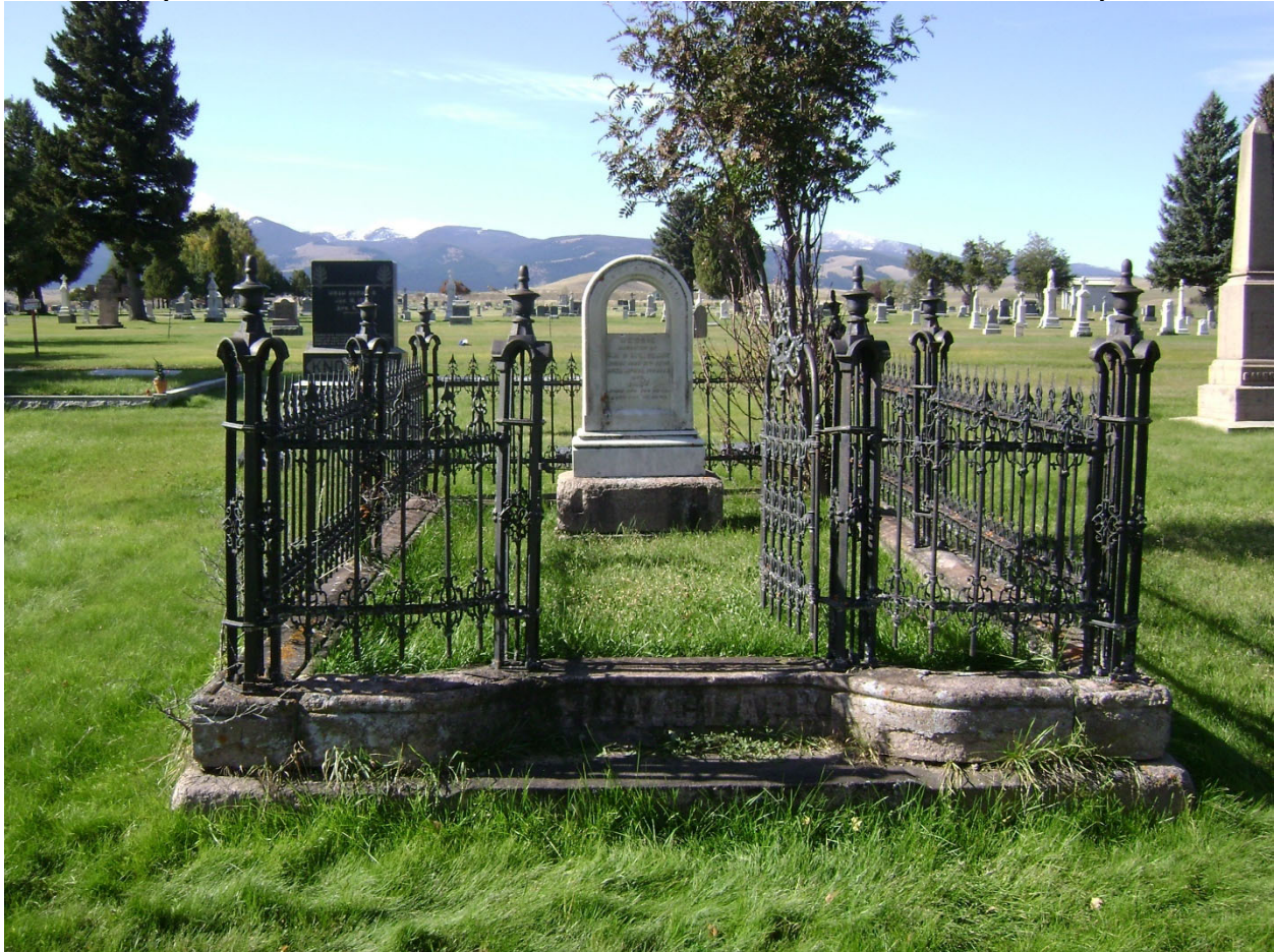
MT_PowellCounty_HillcrestCemetery_#0006, Clark children's grave, (Resource #2), looking west. Date of Photograph: 10/6/19