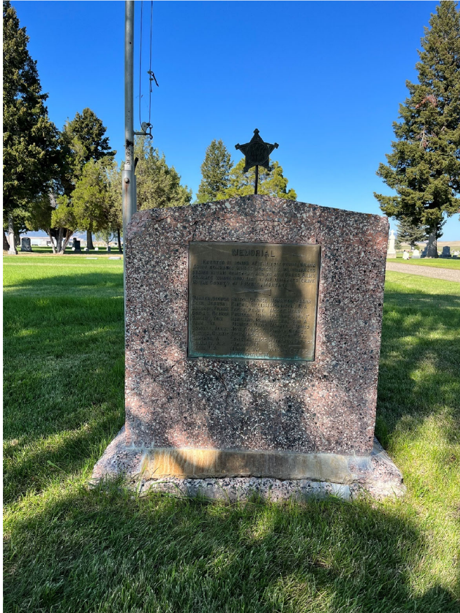
MT_PowellCounty_HillcrestCemetery_#0016, G.A.R. Memorial, Resource #6, looking west. Date of Photograph: 8/31/22.