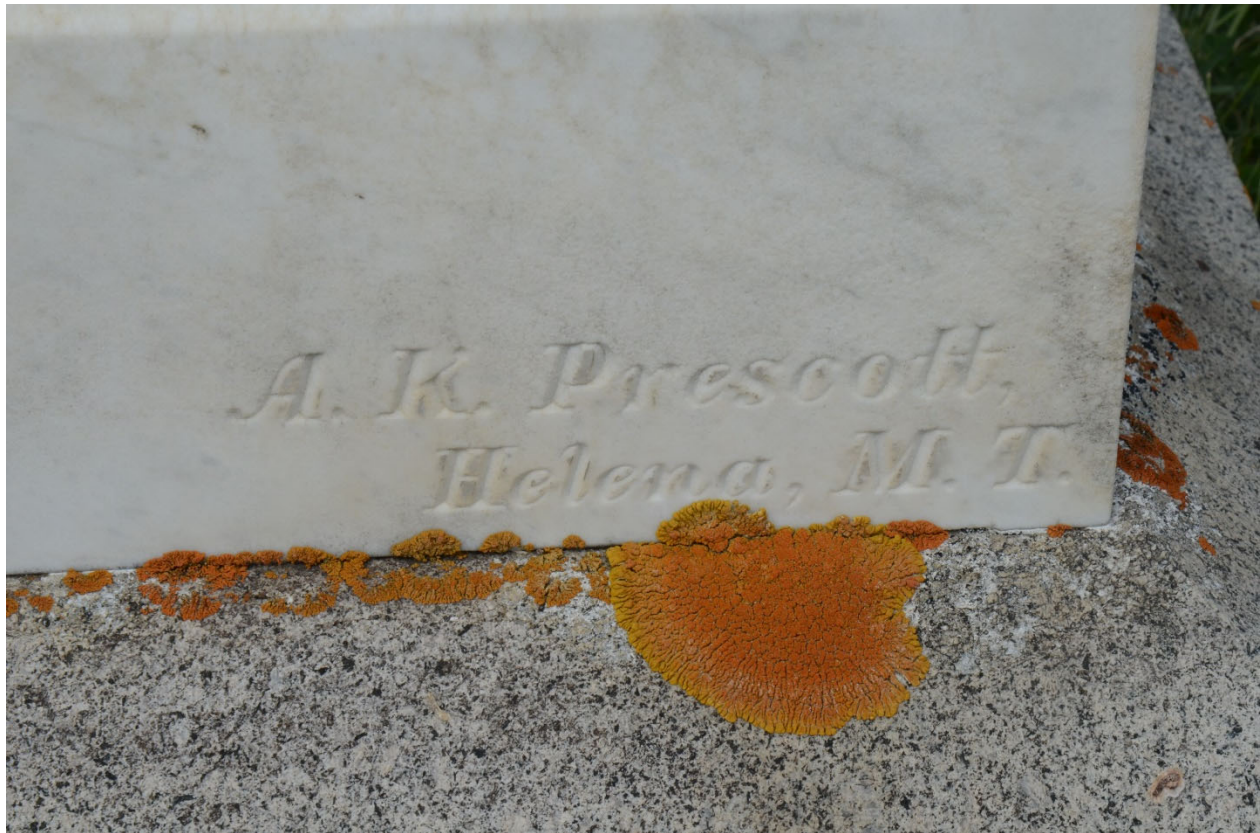
MT_PowellCounty_HillcrestCemetery_#0028, Prescott signature on the Blessinger tombstone. Date of Photograph: 3/14/22