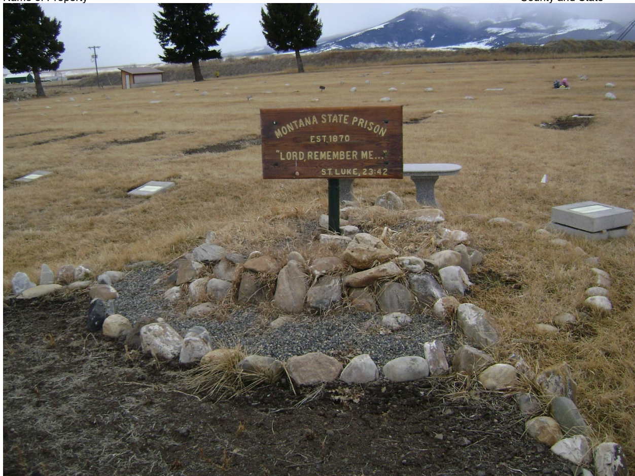
MT_PowellCounty_HillcrestCemetery_#0003, Resource #1, Montana State Prison Cemetery, Hillcrest, looking west. Date of Photograph: 1/25/20