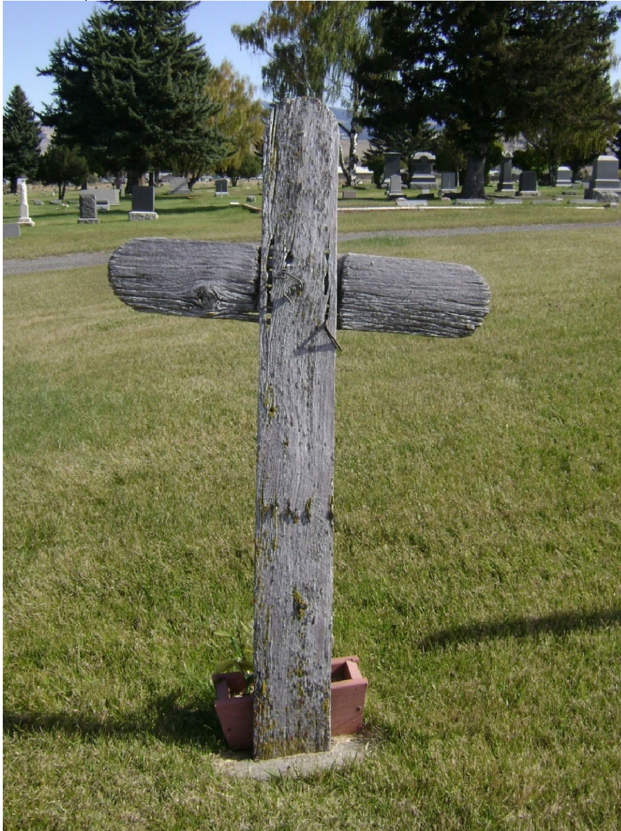
MT_PowellCounty_HillcrestCemetery_#0026, wooden cross, unidentified gravesite, looking northwest.