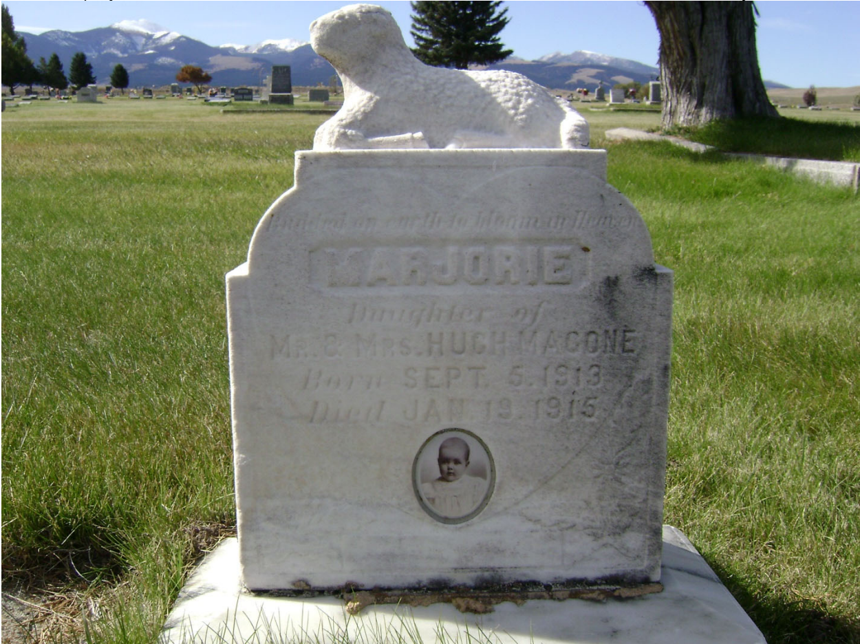
MT_PowellCounty_HillcrestCemetery_#0029, tombstone with portrait of Marjorie Macone looking west. Date of Photograph: 3/14/22