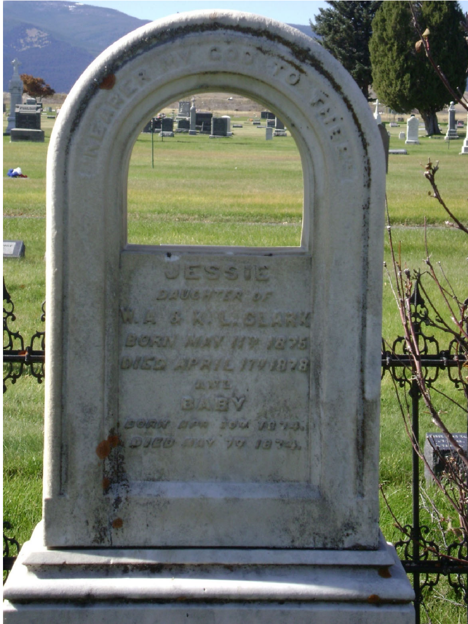
MT_PowellCounty_HillcrestCemetery_#0007, Clark children's gravestone, looking west. Date of Photograph: 10/6/19